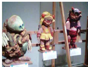
and EXTERIOR DIRECT